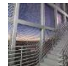
Woven Metal Tension Systems