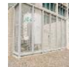
Security and Safety System