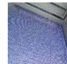
Tensile Structure Made of Metal