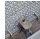
Metal Fabric Attachment Hardware by Cambridge